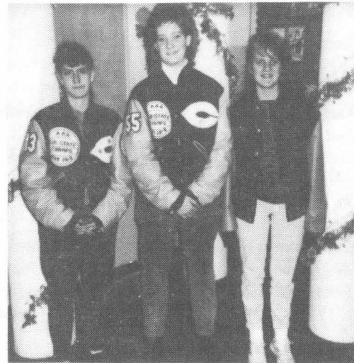
"Collierville High School JCL Officers"

Latin Club members plan to take the National Latin Examination in March. The Club is making plans to attend the State JCL Convention in Knoxville; some members have started working on the skit. Members also plan to attend the Mid-South Latin Tournament in Memphis. A Latin Banquet will be held in May to mark the ending of the school year, and members will wear togas, recline on couches to eat, have authentic foods, and sing Latin Songs.