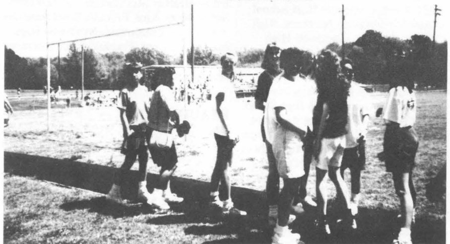
TJCL'ers preparing for Olympics