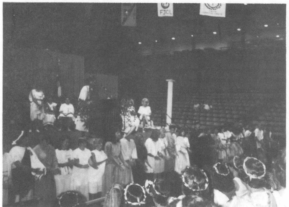
Delegates chanting "Big Fig" in national spirit contest.