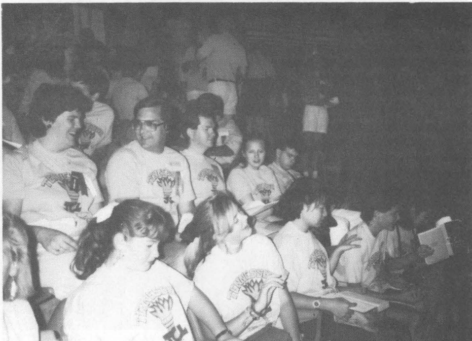
TJCL'ers modeling the new state T-shirt at general assembly.