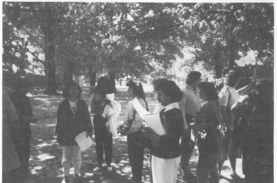
The state officers tour the campus of White Station High School.