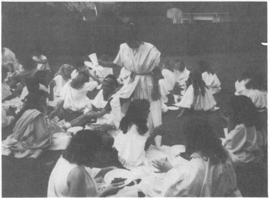
G.H.S. JCL'ers feasting at initiation.