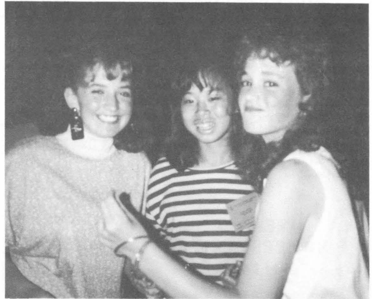
JCL'ers enjoying the dance.

In the midst of the Forum stand the ruins, Dilapidated, run-down, barely existent, Vestiges of a life that once was: A golden culture full of wealth and beauty, Rich in art and literature, Back in the ancient times when Cicero gave his orations from the rostra Or Augustus changed the brick of Rome to marble. These ruins had been whole once before, Edifices built stolid in splendid architecture With columns standing full in length Stretching nearly to Olympus itself And ornate pediments inscribed and inlaid In gold acanthus leaves and silver thorns. Such buildings as the Curia or Temple of Jupiter Once stood in full regal splendor. What remains is but a wreckage — A cruel mockery of previous glory And memories linger among the ruins And tears fall for a remembered past.