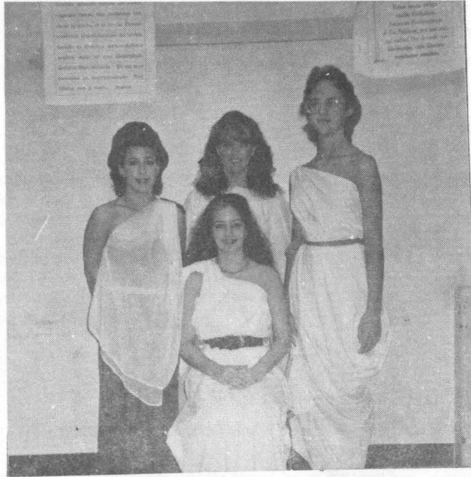
Powell High JCL Officers for 1983-84