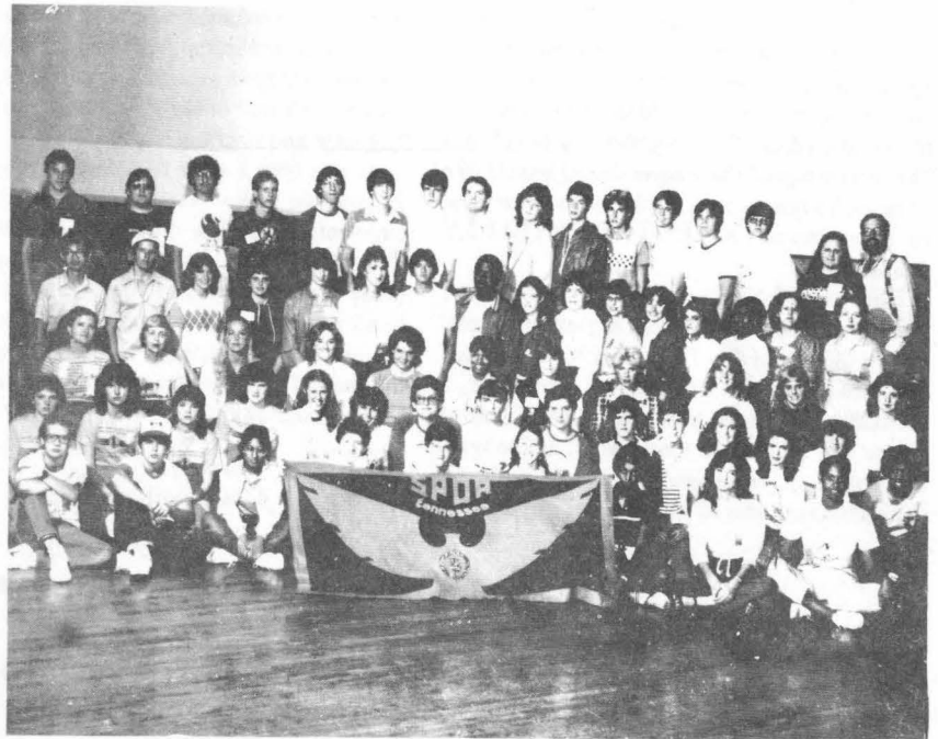
The Tennessee Delegation at Nationals in Rochester, N.Y.

The University of Rochester was an ideal place for the convention where 1353 people were in attendance from 45 states and Canada. The week was filled with assemblies, academic and Olympic contests, costume contests as well as dances, seminars and much more. Everyone especially enjoyed the lovely Roman banquet which was held the last full day of the convention. Everyone agreed that this convention was one fo the best.