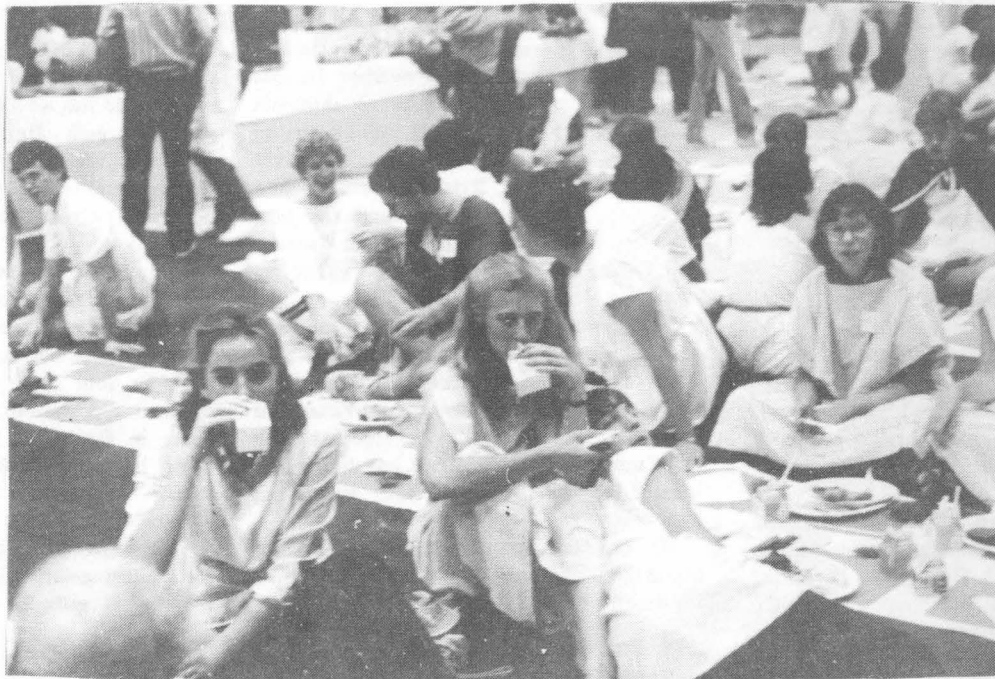
Tennessee Delegates enjoy Roman Banquet in Rochester.