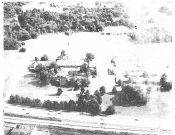
Memphis University School - site of TJCL Convention

Briarcrest and MUS are proud to cohost the 1983 TJCL Convention.