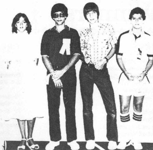
Tennessee Junior Certamen Team