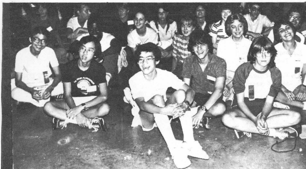
A happy group of TJCL delegates.