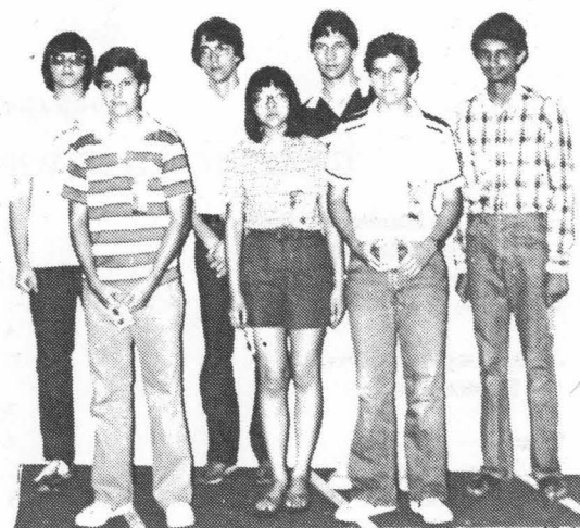
Tennessee High-Score Medalists