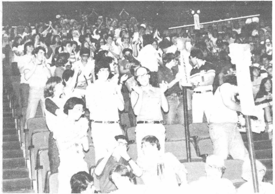
Tennessee delegates cheer with the announcement of their victory.