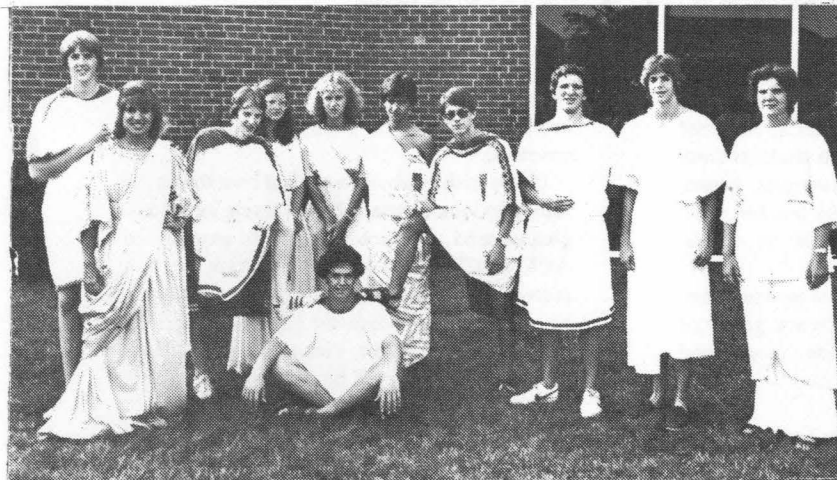
The Doby-Bennett delegation at nationals.