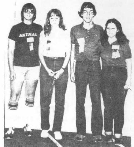
Tennessee Senior Certamen Team